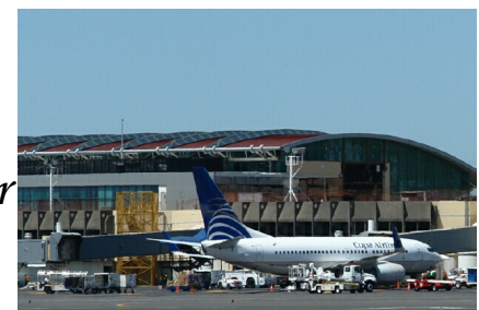
Juan Santamaria Intl Airport