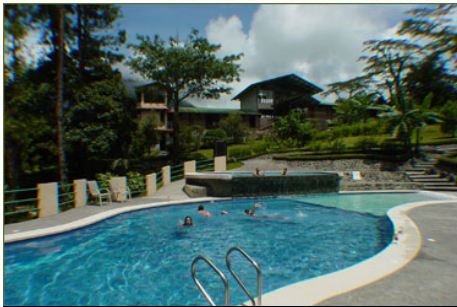
Arenal Observatory Lodge

On your arrival at Costa Rica, you will be picked up at Juan Santamaria Intl Airport on our private shuttle and taken directly to check you in at Hotel Arenal Observatory Lodge. This volcano hotel - perched high on a ridge only 1.7 miles from Arenal Volcano (Volcán Arenal), Costa Rica's most spectacular active volcano - offers the area's most stunning views of the volcano and Arenal Lake. With easy access to the Arenal Observatory