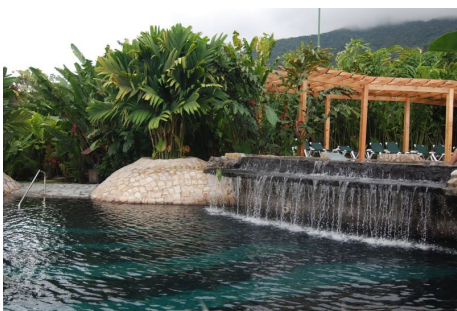
Baldi Hot Springs

At the Observatory Lodge, nature is bursting at the seams. Tropical flora and fauna abound about the Arenal lodge, while the majestic volcano and its fiery outbursts reflect off the mirror lake at her feet – all this right outside your Arenal hotel room at the Observatory Lodge. You can also enjoy of a guided morning hike along one of the property trails.