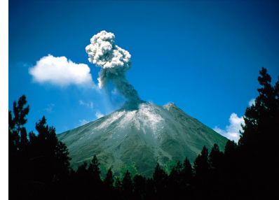
Biking at Arenal

You will enjoy of a breakfast buffet the next day and be able to go on to the Fortuna Waterfall on our horseback ride tour. On your second night you will spend the evening at Baldi Hot Springs Resort and enjoy dinner at this exotic place. Located in the rainforest, at the base of the volcano, this is a truly spectacular place. Relax at this beautiful setting while watching lava flowing to the sides of the volcano. Your honeymoon will just turn magical after experiencing the wonders of the Arenal Volcano. From the heart of the volcano spring fountains of thermomineral water which form the Baldi pools, running at a soothing 39C (102F), forming cascades and natural pools through exotic tropical gardens, and flowing into the pools, to guarantee an unforgettable sensation. The perfect dining experience is the ultimate complement to a full day of adventure, relaxation in hot springs and verdant gardens.