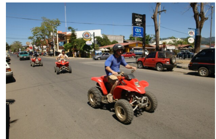
Jaco Beach Town (Optional)