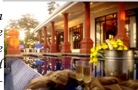
Pool at Hotel Villa Caletas