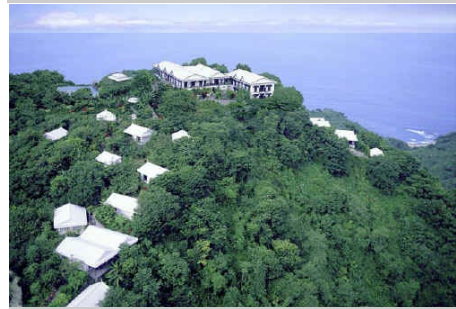
Hotel Villa Caletas