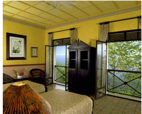
Room at Hotel Villa Caletas

Another activity that you will enjoy while at Villa Caletas is the Catamaran tour to Tortuga Island. The day begins at your hotel where you will be greeted by a bilingual guide and seated on an air-conditioned bus. The bus ride takes you to the pacific port of Puntarenas stopping along the way for Costa Rican typical breakfast.