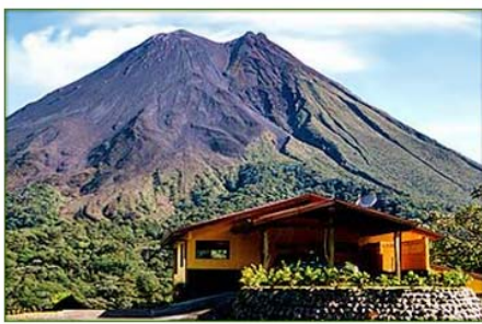
Arenal Observatory Lodge

to the hotel for a hot shower and time to relax and enjoy the rest of the day.