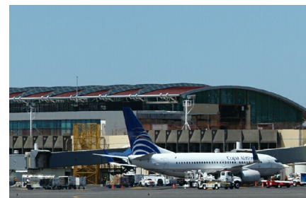
Juan Santamaria Intl Airport

On your last day you will be picked up at the hotel and our private shuttle will take you to San Jose to be on time at the airport. This ends your Costa Rica Overview vacation, with lots of adventure, nature and memories to share with your family and loved ones.