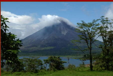
Arenal Volcano and Lake

On your second day in Costa Rica, we will take you to the Arenal Volcano region. The Arenal Volcano is active since 1968 and is constantly ejecting gases, water, fumaroles and explosions that are every visitors amusement.