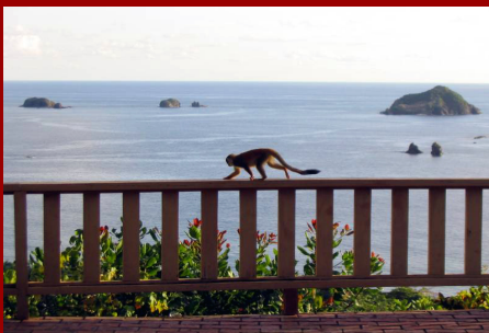
Manuel Antonio view