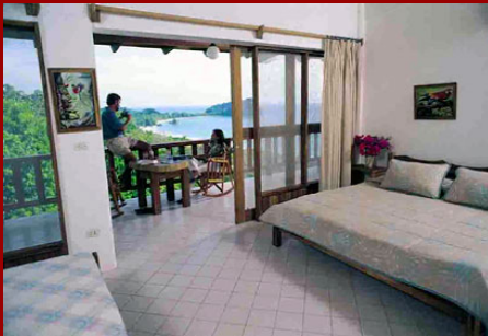
Hotel Costa Verde