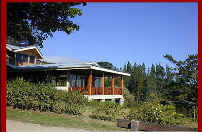
Hotel Sapo Dorado