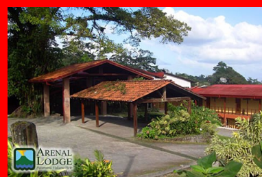
Hotel Arenal Lodge