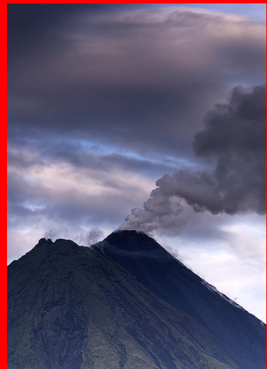
Eruptions at Arenal