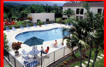
Hotel Holiday Express