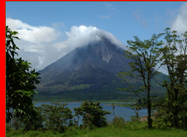
Arenal Volcano and Lake

The Arenal Volcano is active since 1968 and is constantly ejecting gases, water, fumaroles and explosions that are every visitors amusement.