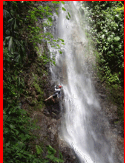
Canyoning at Arenal

On your last day you will be picked up at the hotel and our private shuttle will take you to San Jose to be on time at the airport. This ends your Costa Rica Extreme Experience vacation, with lots of adventure, nature and memories to share with your family and loved ones.