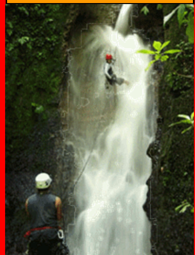
Canyoning at Arenal