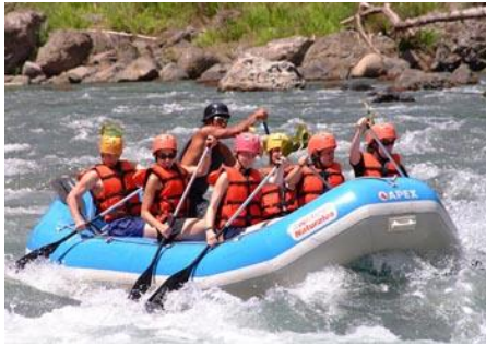
Rafting Pacuare River

After changing comfortably into your swim gear we will drive to our private put in. At our put in the safety talk, equipment fitting and familiarization are done before embarking in the best rafting the country has to offer. You will be ready to raft 14 miles deep in the heart of densely vegetated gorges, past gushing waterfalls, serene