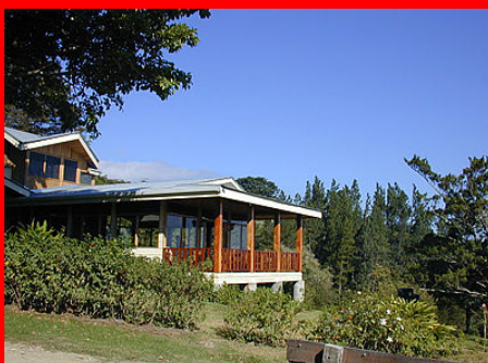
Hotel El Sapo Dorado

You will be checking in at Hotel El Sapo Dorado. For your comfort all suites at El Sapo Dorado offer private entrance and porch, private bath with hot water shower, 2 queen-sized beds with orthopedic mattresses, versatile lighting, and a table and chairs for writing, playing games, or enjoying room service. All suites accommodate up to 4 people and are surrounded by spacious tropical grounds perfect for children's outdoor fun.