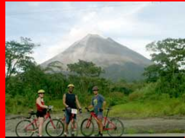
Arenal Volcano Biking

Your trip begins with a 30 minutes 4x4 drive into a tropical Rainforest outside the town of La Fortuna, in the Arenal Volcano . We stop to see many different indigenous plants and animals along the way. We then trek through the forest on magical trails that lead to some of the most spectacular waterfalls in Costa Rica, a place very few people get to experience. Along the way we will have the chance