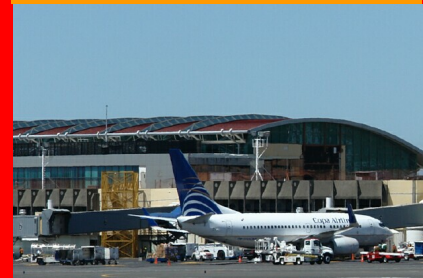
Juan Santamaria Intl Airport