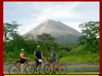
Arenal Volcano Mountain Biking (Optional)