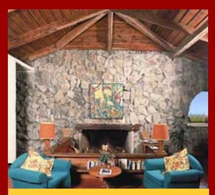
Hotel Poas Volcano Lodge