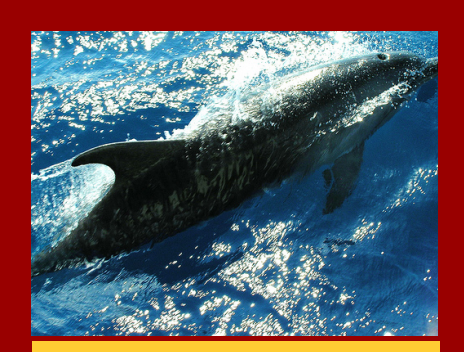
Sailing in Manuel Antonio

Poas Volcano Lodge lies between the Poás and Barva Volcanoes at 6200 feet above sea level on the ridge dividing the Atlantic and Pacific zones of the country. The lodge is nestled into the rolling pastures, at the foothills of Poás Volcano, one of the world's largest active craters. The impressive views from the house include not only the volcano, but also the western area of the spectacular Braulio Carrillo National Park as well as the Caribbean plains and