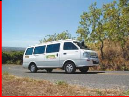
Shuttle to the Airport