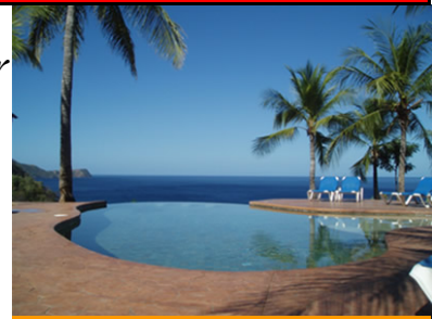
Ocotal Beach Resort

Ocotal is a four-star beachfront resort, a leader among Costa Rica's hotels and resorts, known for its outstanding style, comfort, and service. The property lies along the country's beautiful Northern Pacific coastline and yields breathtaking panoramic views of the Papagayo Gulf.