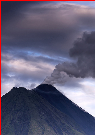
Eruptions at Arenal