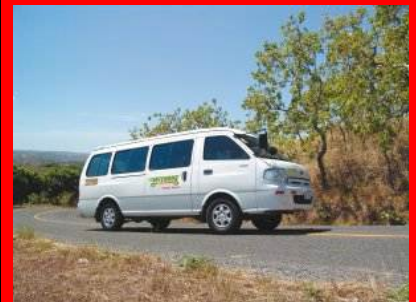
Shuttle to the hotel

Once in the Arenal region, you will be checking in at hotel Arenal Lodge. This cozy lodge located on a 2000 acre property, surrounded by lush nature and a rain forest housing hundreds of exotic birds and animals, offers a unique panoramic view of the volcano and lake with our warm hospitality.