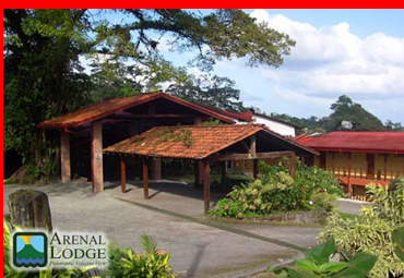
Hotel Arenal Lodge

The Arenal Volcano is active since 1968 and is constantly ejecting gases, water, fumaroles and explosions that are every visitors amusement.