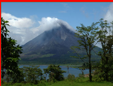
Arenal Volcano and Lake