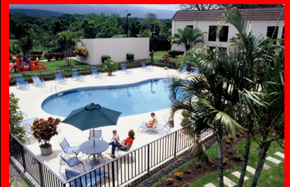
Hotel Holiday Express